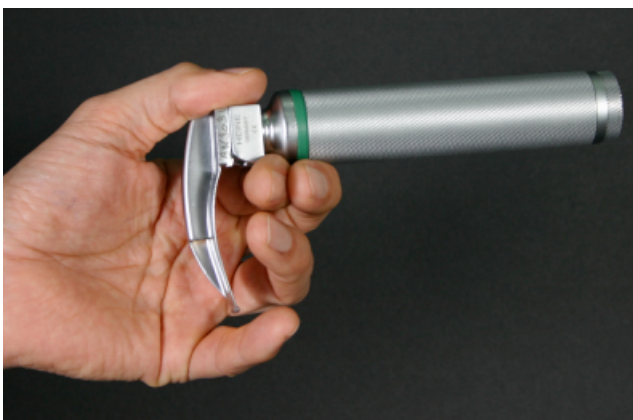
Fig. 3. Laryngoscope grip in order to be able to apply pressure on the neck with the fifth finger. The first finger should not touch the handle of the laryngoscope, but be placed on the proximal end of the blade.

When the vocal cords are visualised, the endotracheal tube is inserted between them, and with-