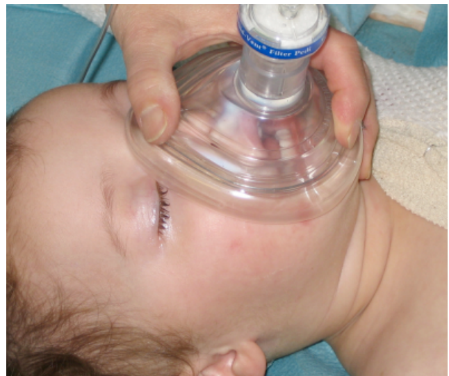
Fig. 2. The face mask should be large enough to allow the mouth of the child to be open during ventilation, but at the same time it should not cover the eyes of the child.

It may be helpful to show the face mask to the child before mask induction. If the mask is waved in front of the infants, their natural instinct is to grab for the mask and 'taste' it, thereby facilitating induction.