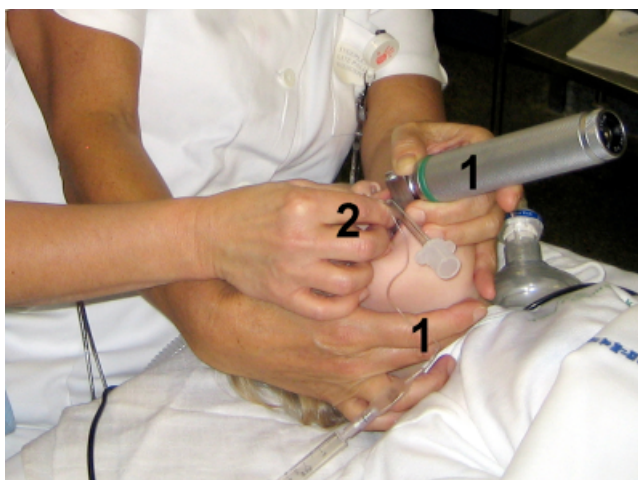
Fig. 5. Two-anaesthetist intubation. One person performs laryngoscopy and external manipulation of larynx to optimise the intubation condition, while a second person inserts the endotracheal tube.

Before extubation, the child should be on spontaneous ventilation. Whether it should be performed during deep anaesthesia or in the awake state is probably a matter of preference, but it is also influenced by the actual circumstances. After airway surgery, if the anaesthesiologist has less paediatric experience, or if the airway was difficult to