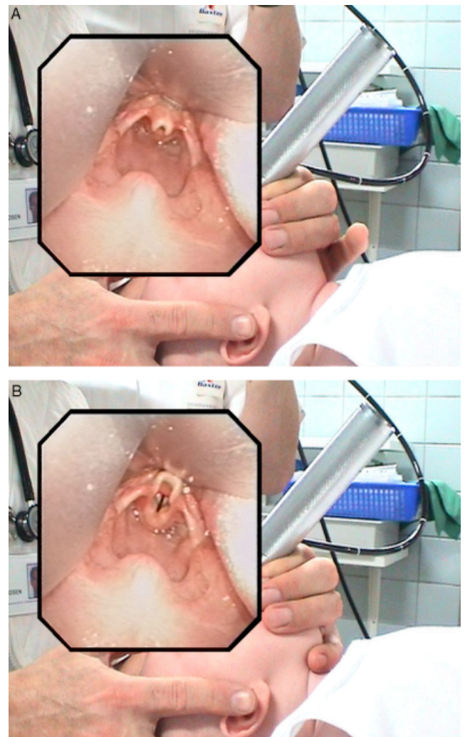
Fig. 4. (A) Glottic view without applying external pressure on the larynx. (B). Glottic view with a slight pressure on larynx with the fifth finger.

out use of force, it is then moved through the cricoid cartilage. In infants, the vocal cords are angled more anteriorly, and if the tip of the tube is caught in the anterior commissure, a slightly rotating movement of the tube will often solve the problem. It is important not to obstruct the view to the larynx during intubation to be able to visually control how far into the trachea the tube is inserted. As soon as the tube is in place, the centimetre marking near the gingiva or teeth is noticed. In this way, it is possible to re-establish the position of the tube, if it is accidentally moved during fixation. In premature children or other situations when a very accurate location of the tip of the endotracheal tube is critical, another technique may be helpful. During ventilation, the endotracheal tube is slowly advanced further, while at