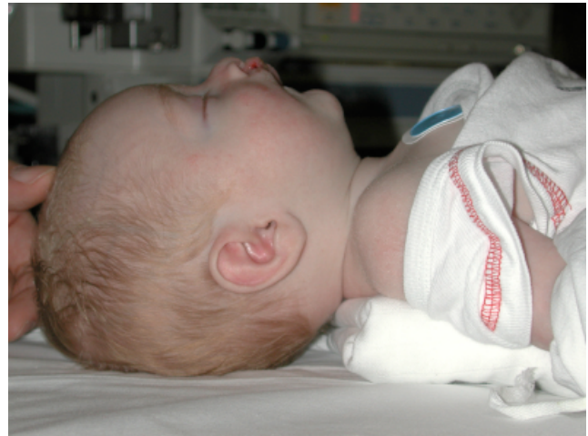
Fig. 1. The optimal position for airway management is with the head in a neutral or slightly extended position. In premature children, a small towel under the shoulders is helpful.

Many different types of face masks are available on the market. A transparent, disposable mask with a large and soft cuff is recommended, as this feature makes it very easy to establish an airtight seal to the face. At the same time, the transparency is useful, and the children seem to find them less frightening than the black masks. It is important to choose a face mask large enough to allow the mouth of the child to be open during ventilation, but at the same time the mask should not cover the eyes of the child (Fig. 2). The tongue falls back when the child is anaesthetised and this tends to obstruct the airway. Obstruction is best avoided if the mouth is kept open during mask ventilation. This is accomplished by pressing the distal cuff of the mask against the chin. No pressure should be applied against the floor of the mouth, as this will press the tongue against the palate and airway obstruction may result.